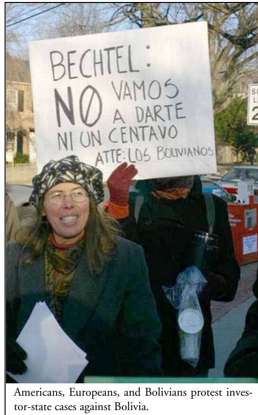
Americans, Europeans, and Bolivians protest investor-state cases against Bolivia.

compensation. And, of course, under the bilateral trade agreement they are entitled to that compensation. Thus the still-suffering citizens of the country are treated to the prospect of U.S. investors being made whole while everyone else bears losses from an economic catastrophe that has afflicted the entire nation. Regardless of what one thinks of the merits of capital controls, one would have to be naïve not to think that an anti-American backlash would result.” 32