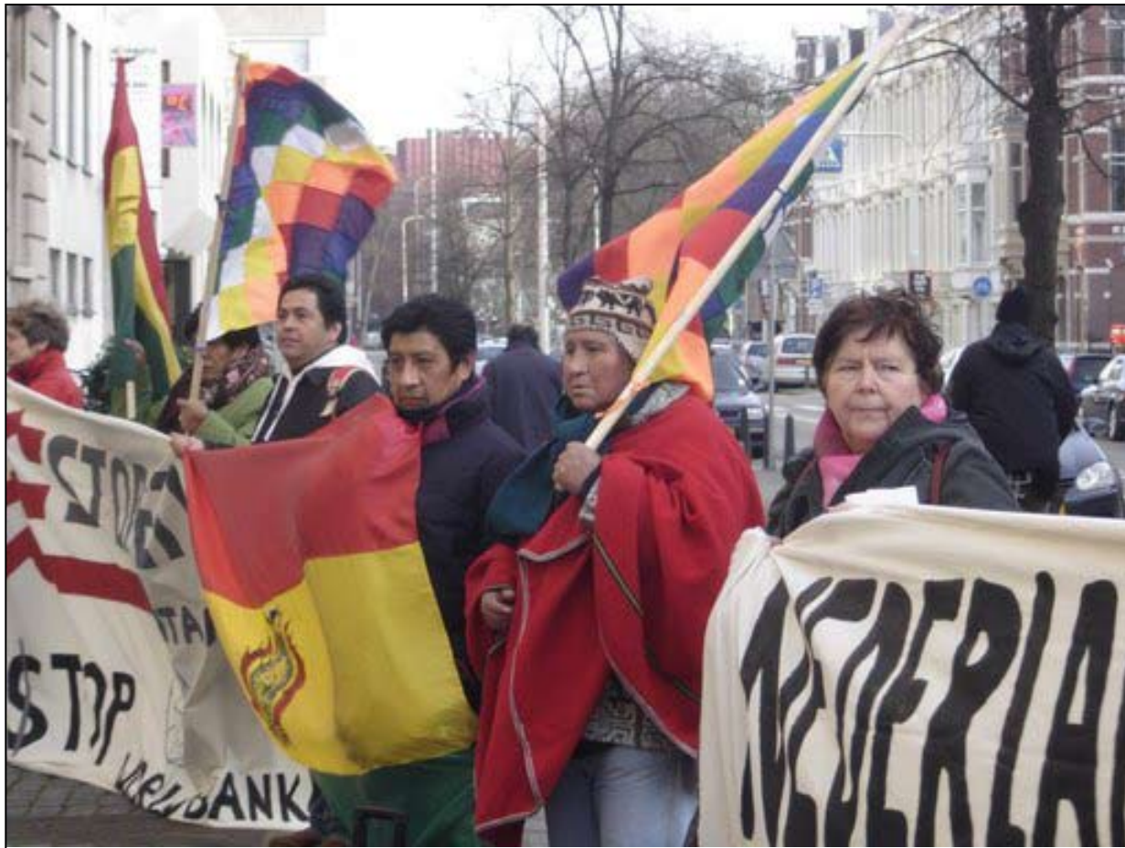
Europeans and Bolivians protest investor-state case brought by Telecom Italia in 2008.

were in office at the time their country’s agreement was signed. 10 And once BITs are in force, they operate much like straitjackets. The U.S.-Bolivia treaty is typical. After the initial 10 years, either party can give one year’s written notice of intent to terminate the treaty, but the treaties’ protections continue to apply for another 10 years. Hence, this treaty, enacted in 2001, is designed to lock in both countries’ commitments at least until the year 2022. Only if both countries agree to renegotiate can changes be made in a shorter timeframe. Free trade agreements typically have less onerous termination clauses. NAFTA, for example, requires only six months’ notice. This more liberal approach is likely based on the assumption that governments would be loathe to withdraw from a comprehensive trade pact for fear of provoking a “trade war.” Indeed, in response to President Obama’s calls for NAFTA renegotiation, Mexico’s ambassador to the United States declared that this “would be nothing short of opening Pandora’s box.” 11